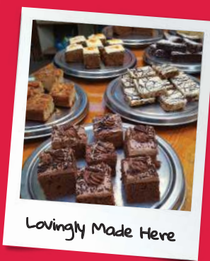
Lovingly Made Here